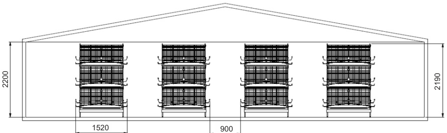
Example of installation - three levels