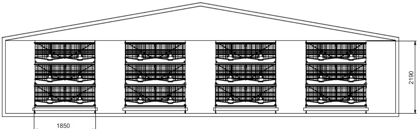
Example of installation - three levels